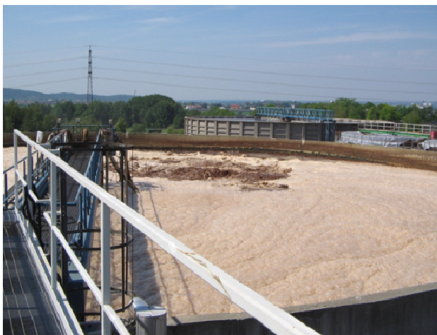
Figure 1. One of two aeration ponds taking part in the biological degradation of organic substances in wastewater from Borregaard's production processes, Sarpsborg, Norway.

more than 49 different Legionella species have been described in which 19 species may cause infections in humans (3, 4). The species L. pneumophila contains at least 16 serogroups, in which serogroup 1 (SG1) is most frequently associated with legionellosis. Outbreaks of legionellosis caused by L. pneumophila SG1 have been traced back to various anthropogenic aerosol generating sources (5, 6 and 7), exemplified by industrial cooling towers, sanitary landfill sites, wastewater treatment plants, and evaporate condensers.